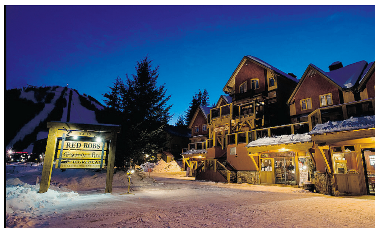
Red Mountain was voted Best Ski Resort by Powder Magazine.