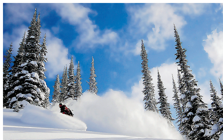
Red Mountain Resort features more than 1,685 acres of skiable terrain, with several options at different sites on the mountain.

Guess again. This intimate scene, reminiscent of mountain villages in Switzerland or France, is replete with European charm but much closer to home. Red Mountain is in Rossland, B.C., and is nestled between the Selkirk and Monashee mountain ranges, in part of the B.C. interior marketed as the Kootenay Rockies. This mere seven-hour drive from Calgary, depending on the weather, is well worth the